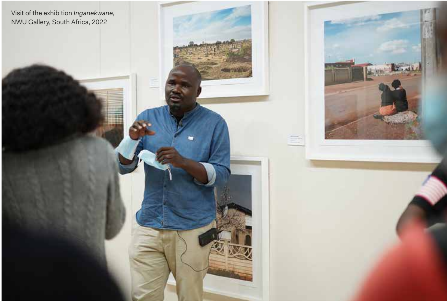
Visit of the exhibition Inganekwane , NWU Gallery, South Africa, 2022