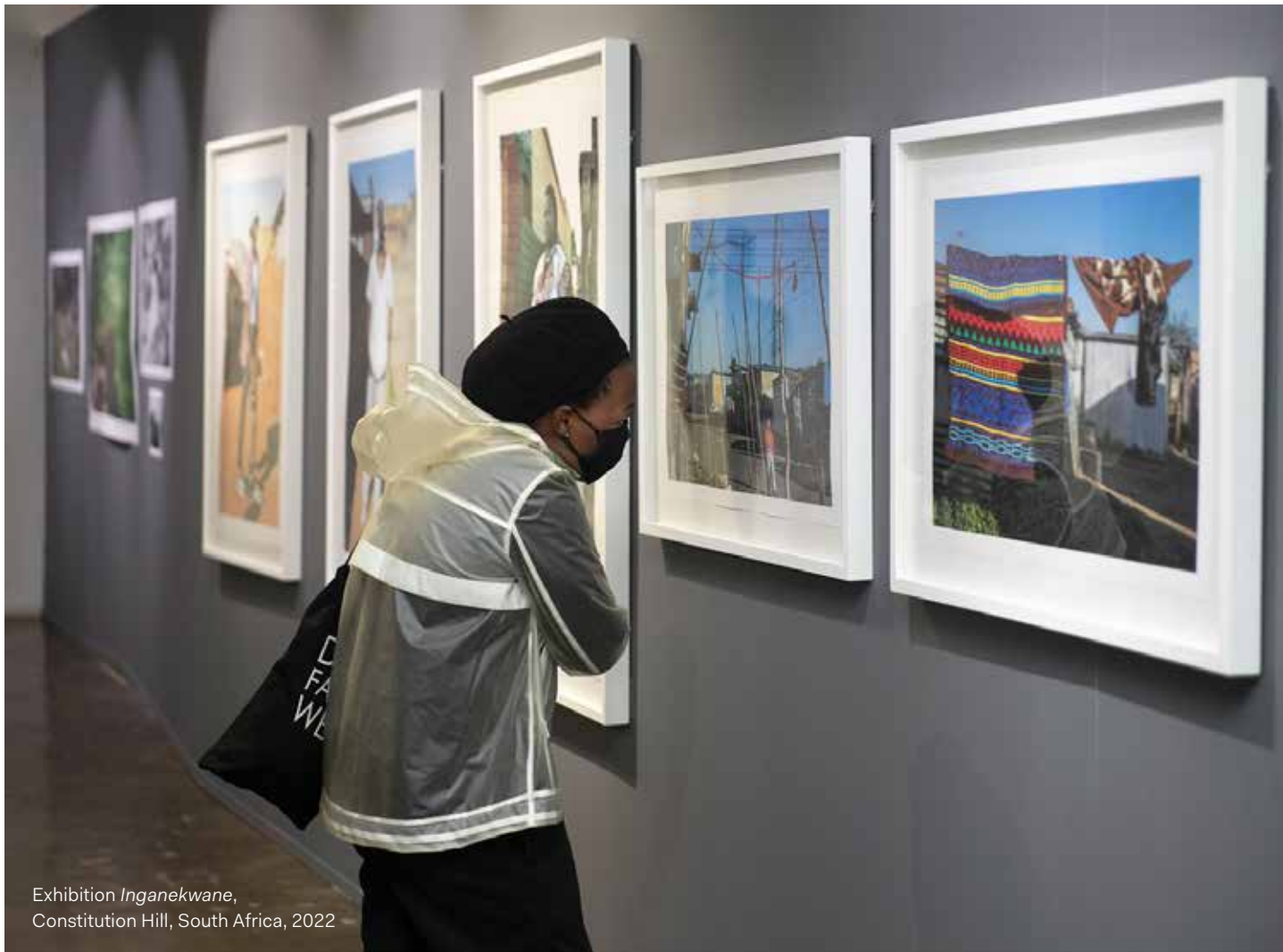
Exhibition Inganekwane , Constitution Hill, South Africa, 2022