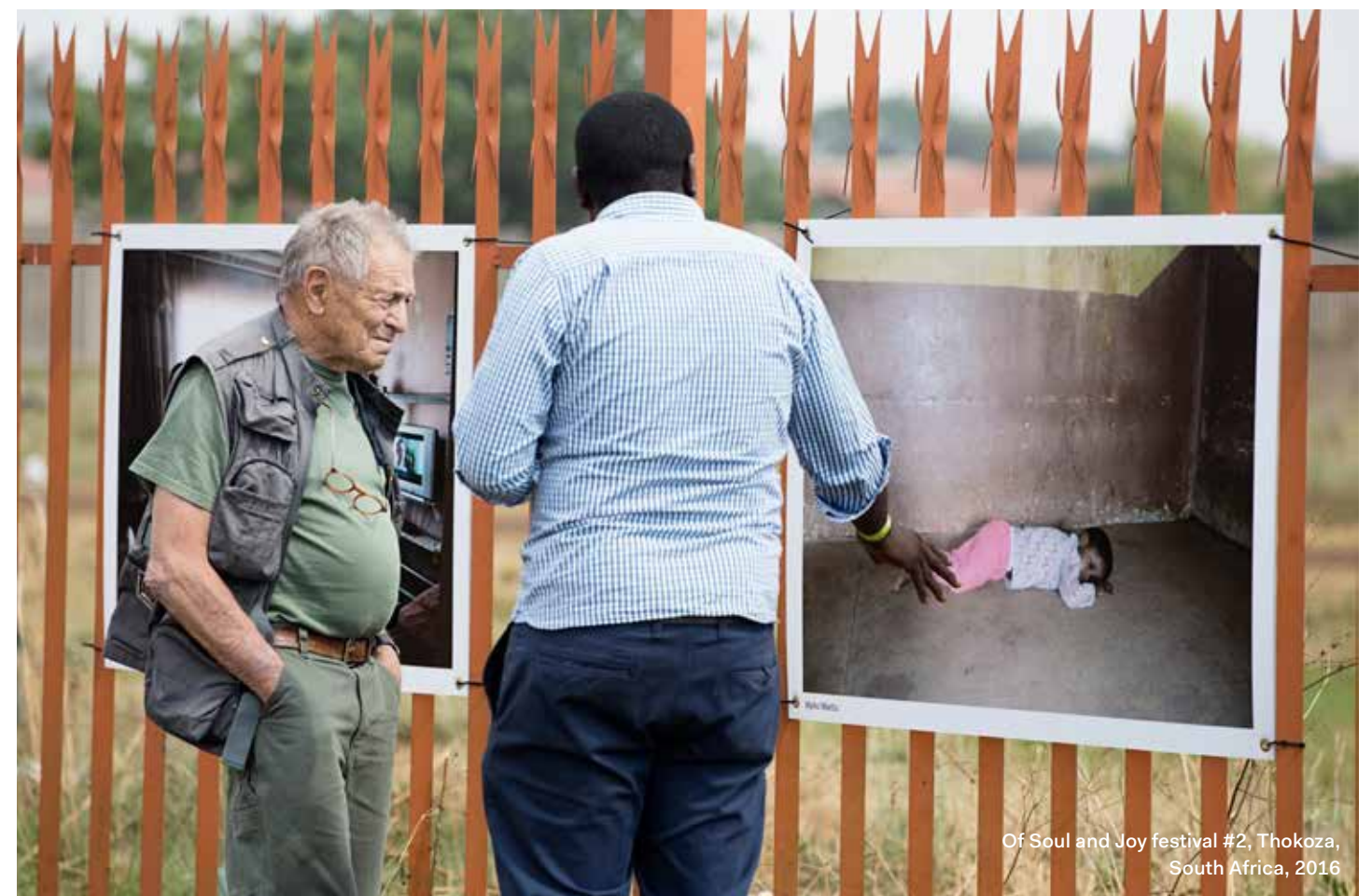
Of Soul and Joy festival #2, Thokoza, South Africa, 2016