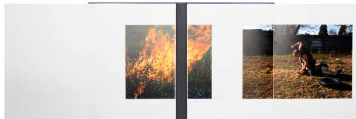
Detail of the book Daleside: Static Dreams

Theminkosi Hlatshwayo, Slaghuis II, 2019