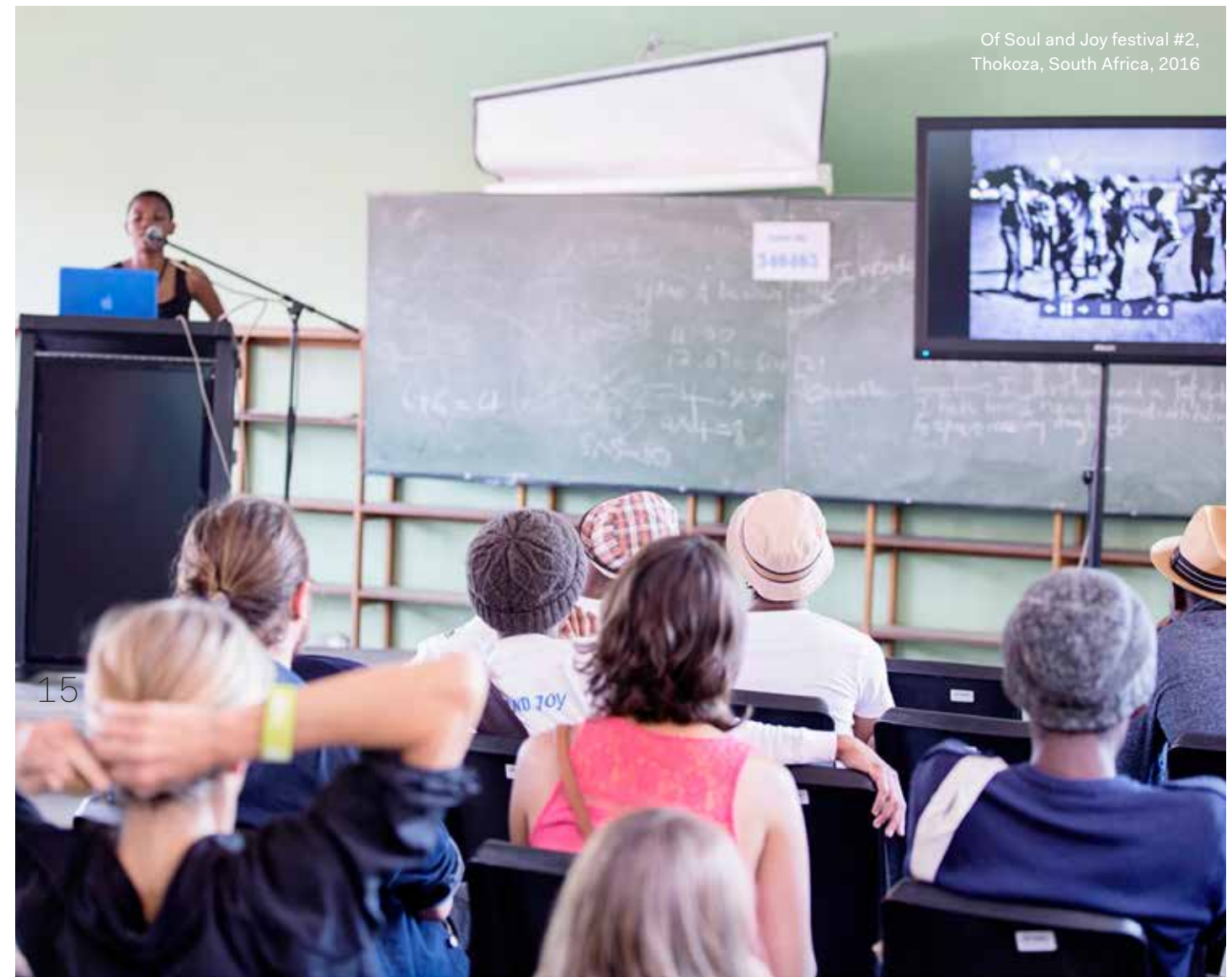
Of Soul and Joy festival #2, Thokoza, South Africa, 2016