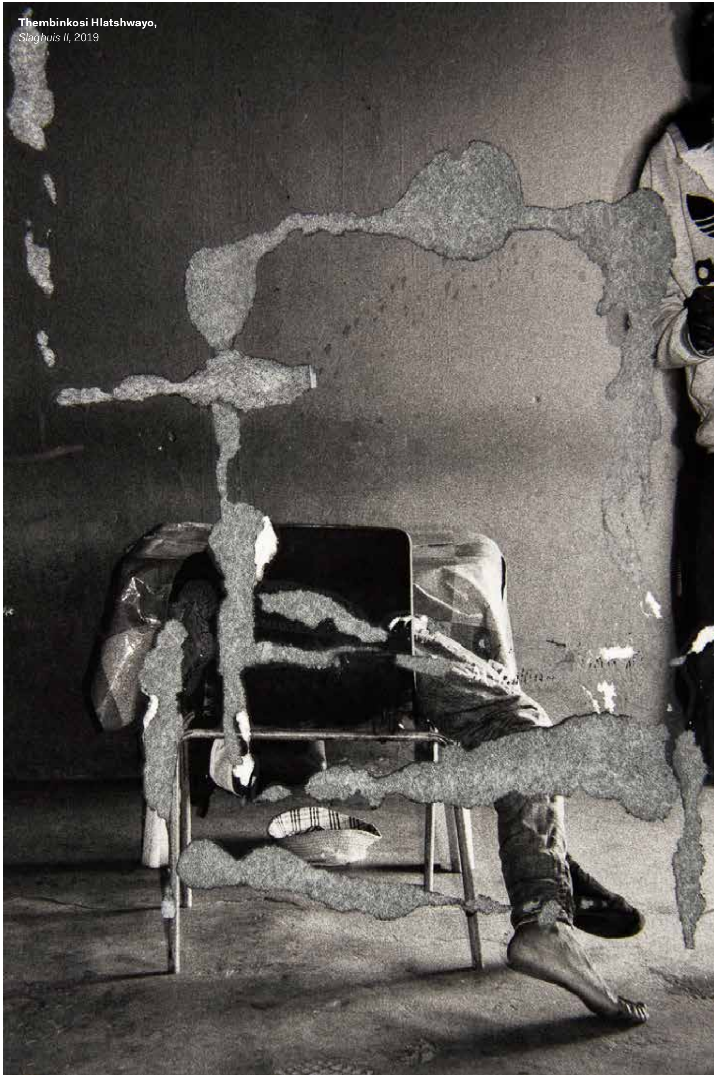
Thembinkosi Hlatshwayo, Slaghuis II , 2019