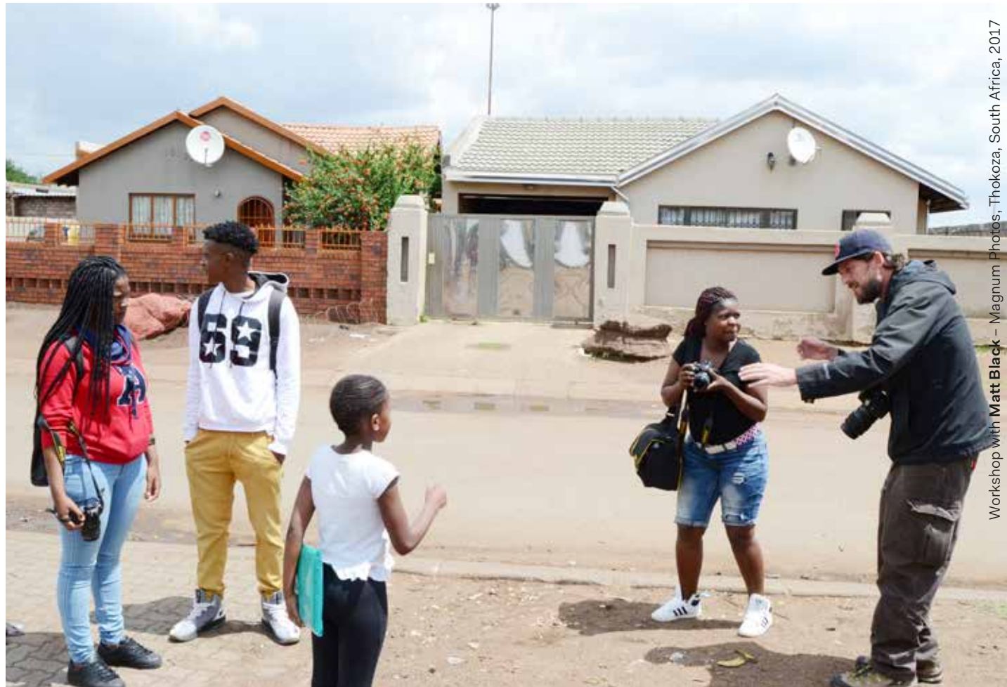
Workshop with Matt Black – Magnum Photos, Thokoza, South Africa, 2017