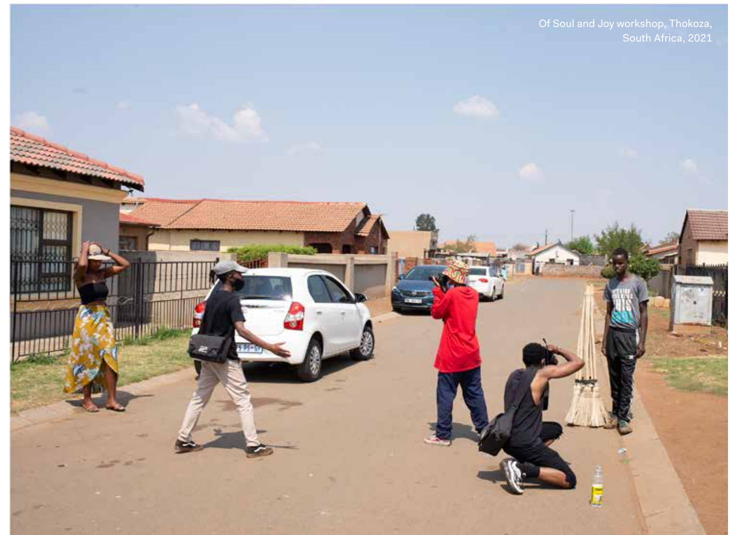
Of Soul and Joy workshop, Thokoza, South Africa, 2021