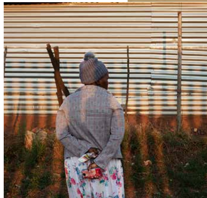
The Everyday Waiting , 2020