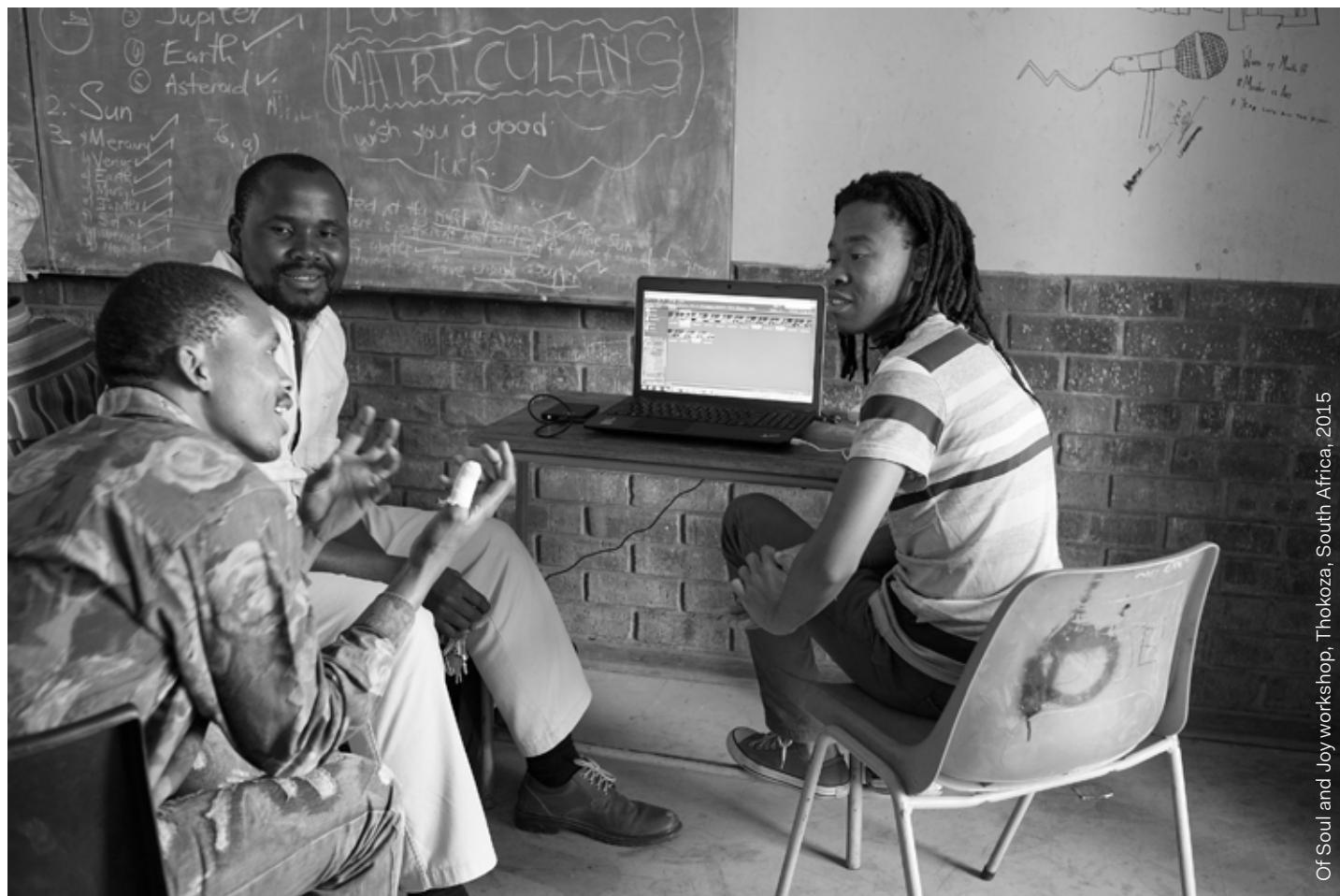
Of Soul and Joy workshop, Thokoza, South Africa, 2015