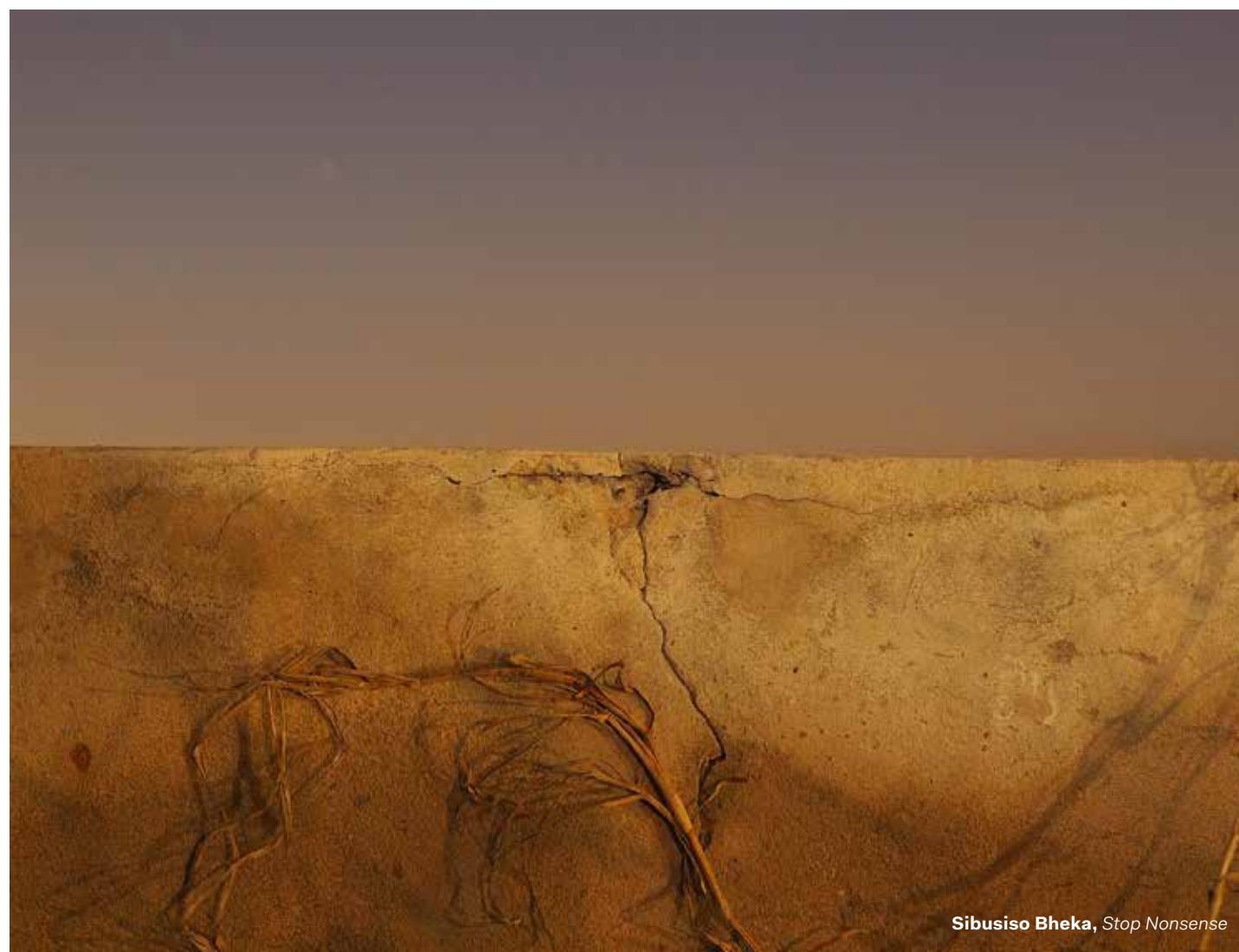
Sibusiso Bheka, Stop Nonsense