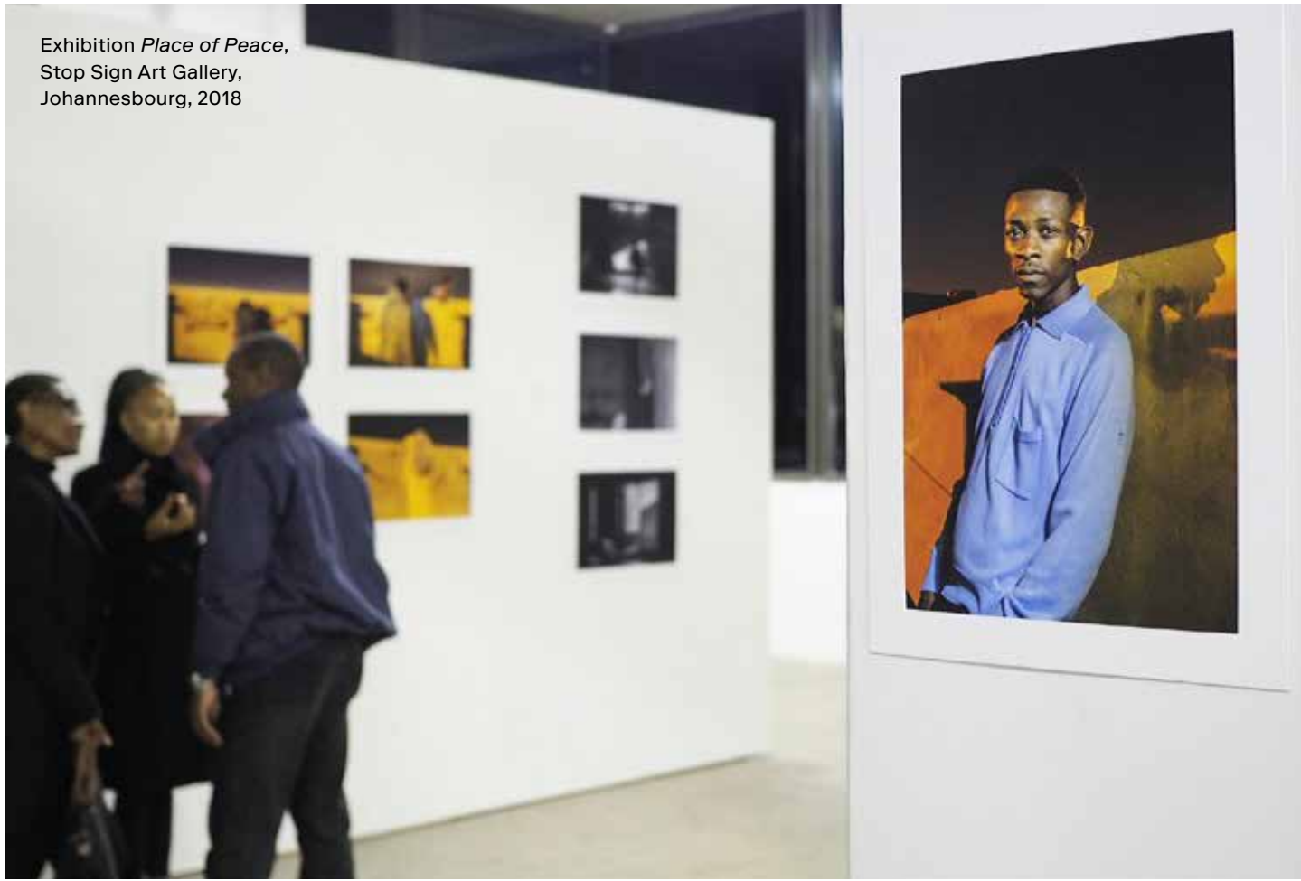
Exhibition Place of Peace , Stop Sign Art Gallery, Johannesburg, 2018