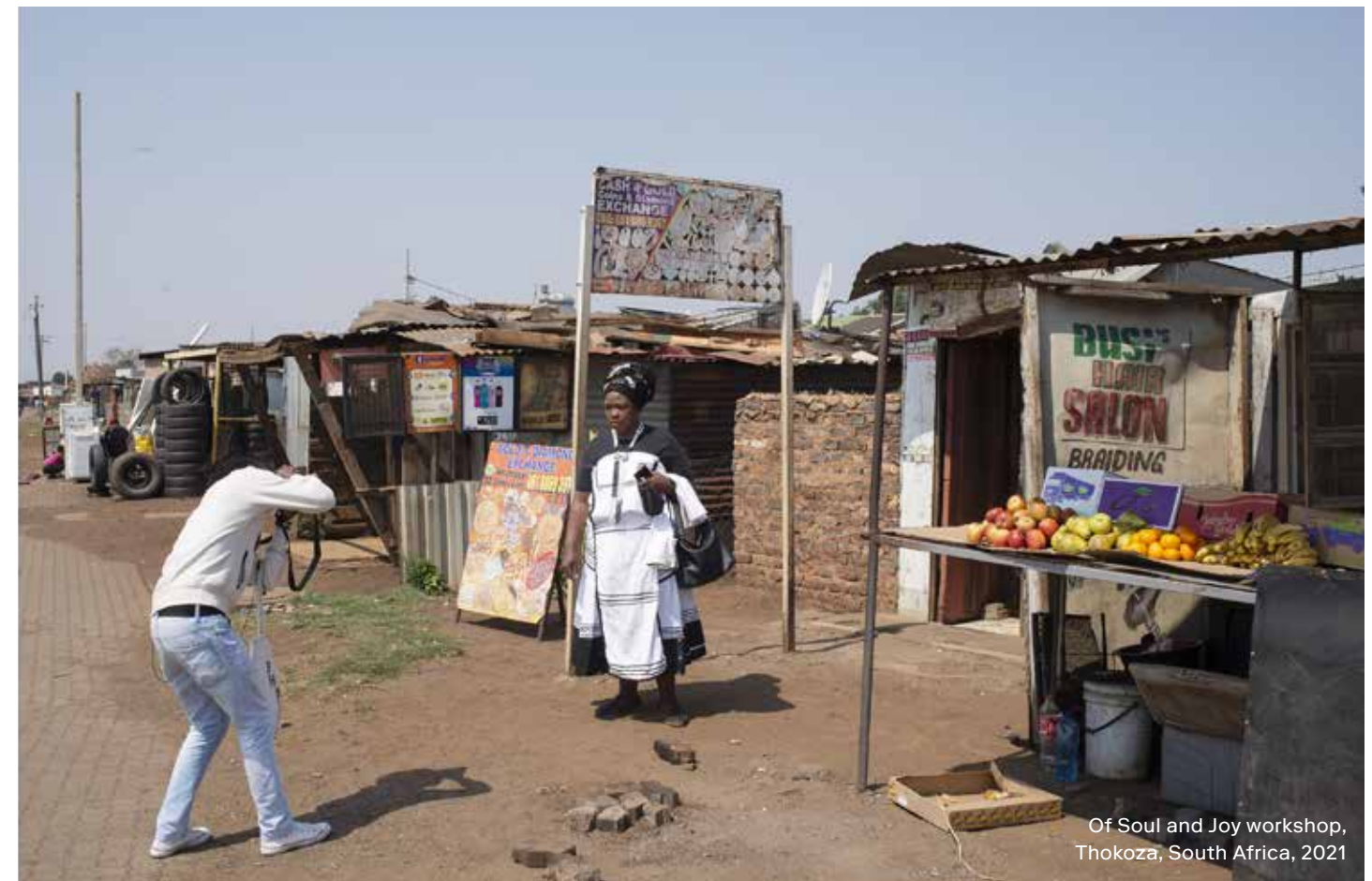
Of Soul and Joy workshop, Thokoza, South Africa, 2021