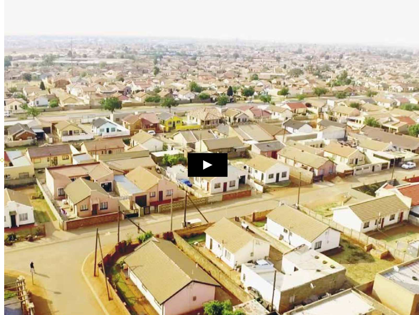
In Thokoza, documentary film on the Of Soul and Joy project, 2013-2016