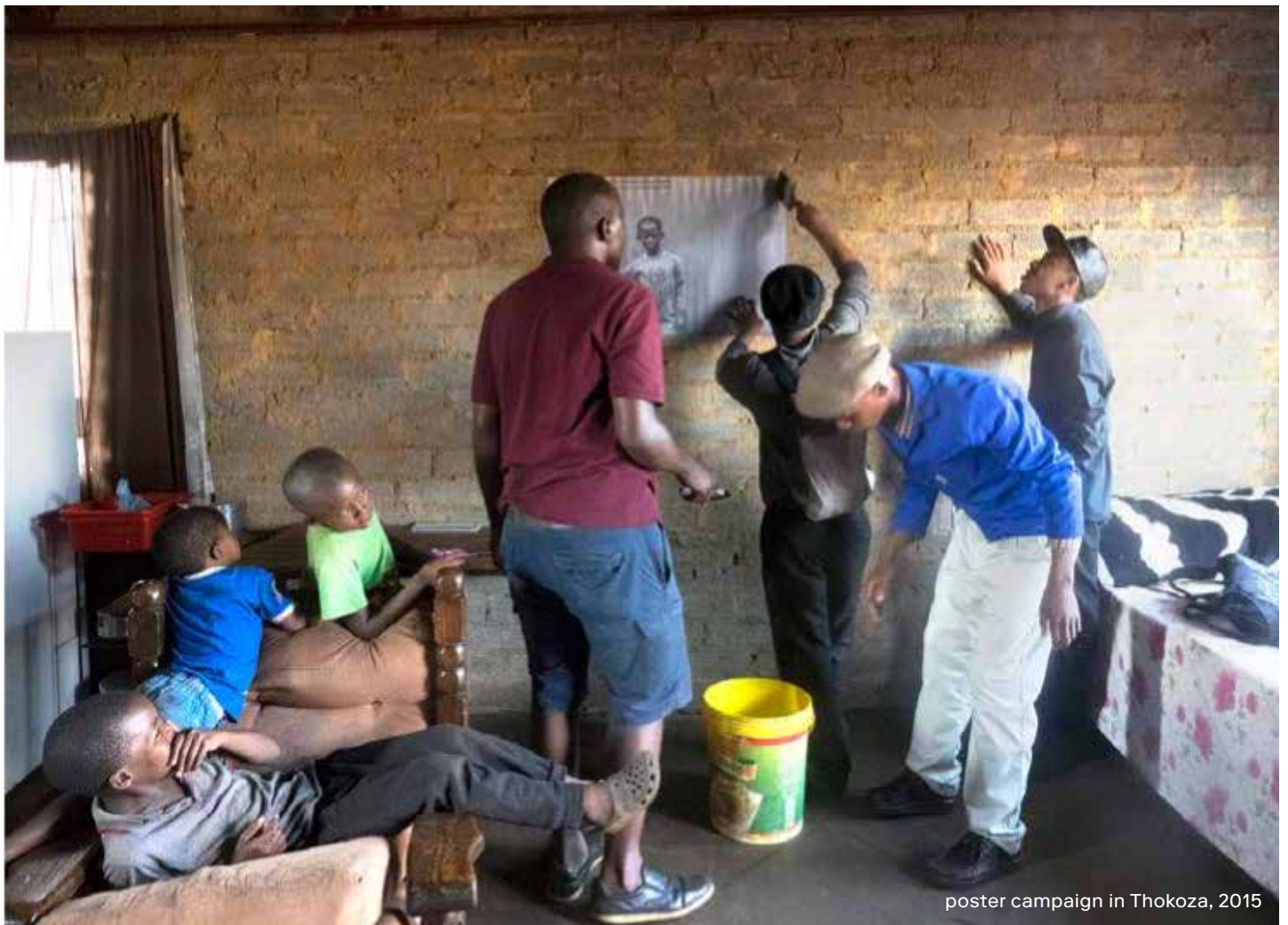
poster campaign in Thokoza, 2015