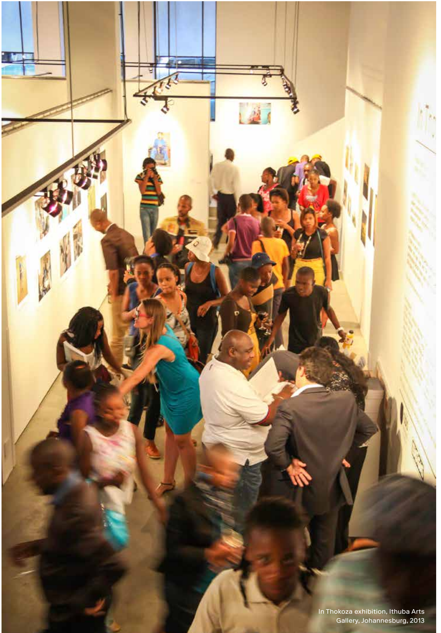
In Thokoza exhibition, Ithuba Arts Gallery, Johannesburg, 2013