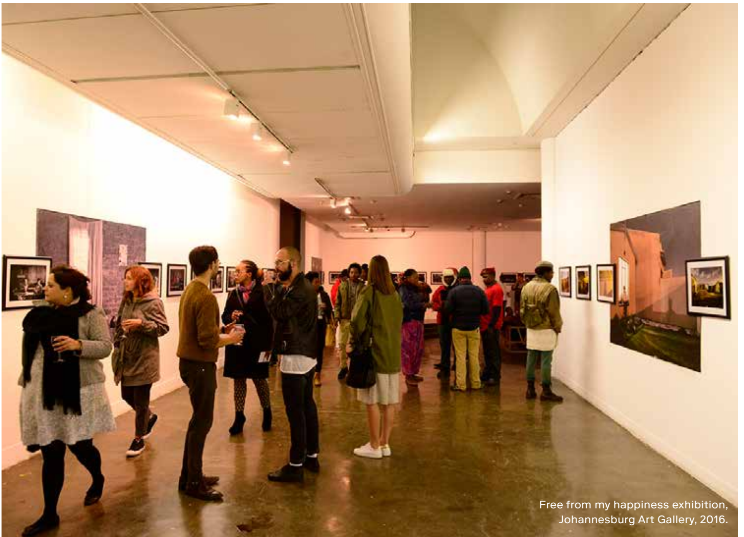
Free from my happiness exhibition, Johannesburg Art Gallery, 2016.