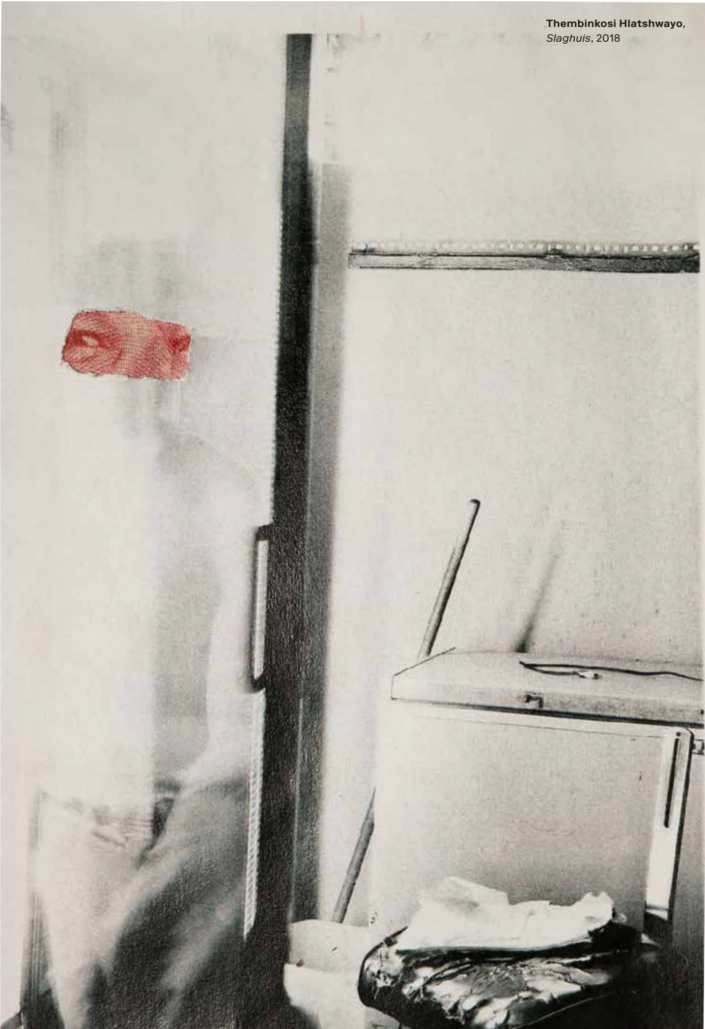
Thembinkosi Hlatshwayo, Slaghuis , 2018